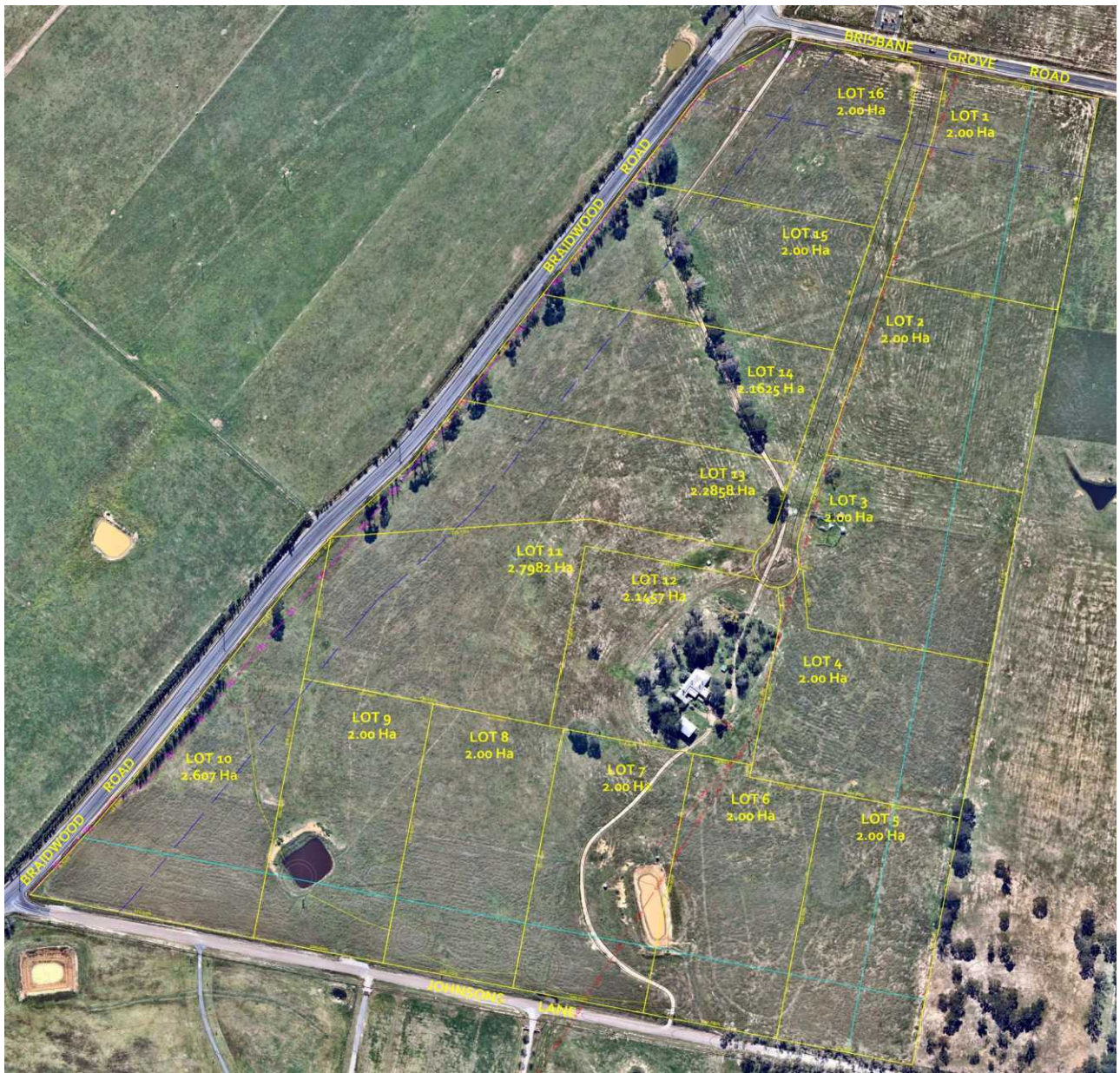
Allfarthing draft subdivision plan