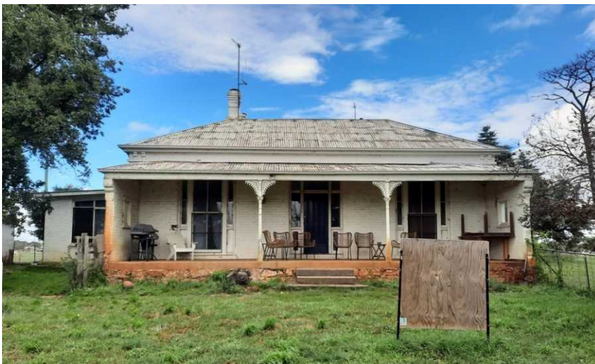
2021 Principal elevation