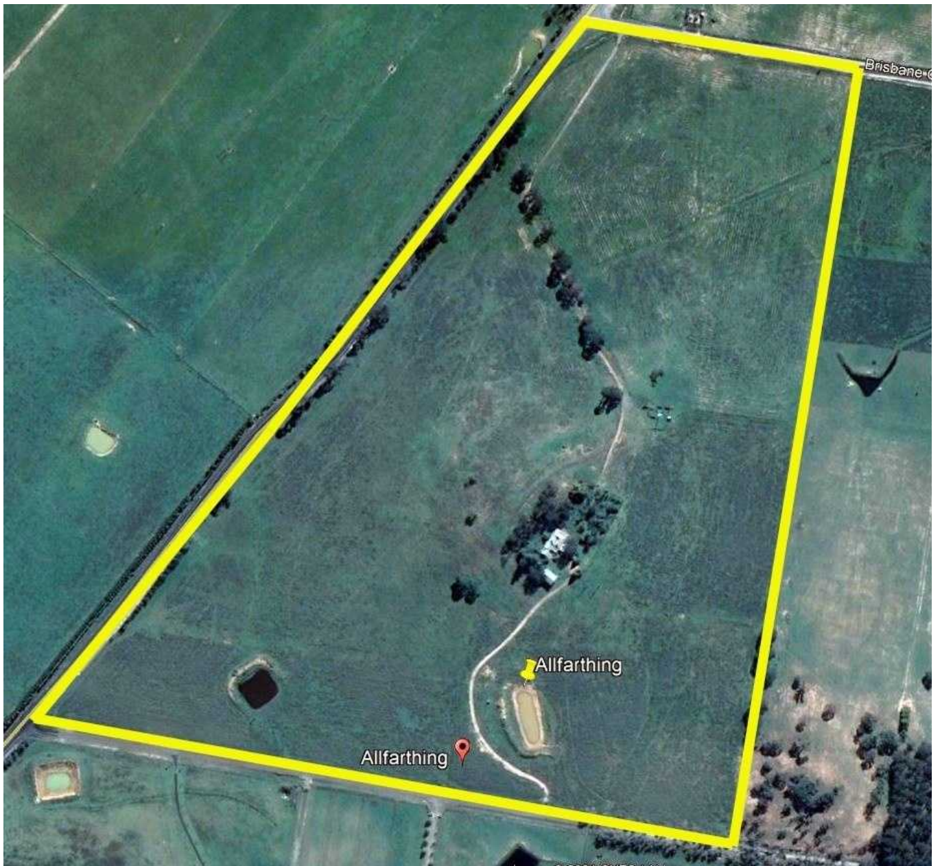
Aerial view of Allfarthing